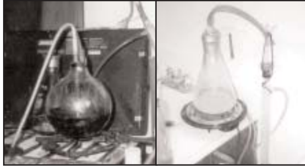
Smaller labs can be set up with basic lab equipment and household appliances.

Generally speaking, the two lab types present different challenges for police. The super labs account for up to 80 percent of all methamphetamine produced. 13 So, from a supply control perspective, they are of far greater concern. However, the small labs account for far more explosions, fires, uncontrolled hazardous waste dumping, and child endangerment. This is largely because less-skilled cooks operate the small labs, using more primitive equipment and facilities. Many small-lab cooks are parents and methamphetamine abusers themselves, and their drug dependency leads them to neglect their children's welfare. So, if the challenge is to reduce explosions, fires, environmental damage, and child endangerment, then the small labs are of greater concern.