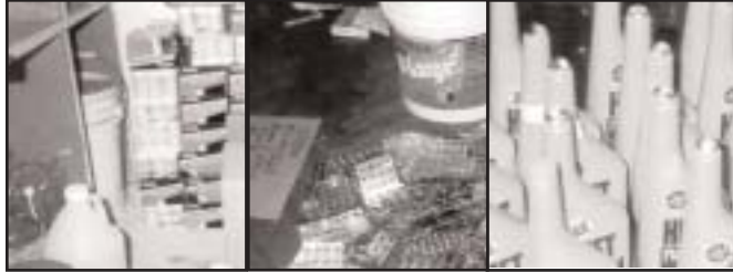
Some of the chemicals needed to produce methamphetamine can be derived from products available for purchase without regulation at retail outlets.

† The red phosphorous method used to be termed the "cold cook" method, but this can be misleading: cooks may or may not use heat to speed up the cooking process.