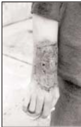
Chemicals in clandestine drug labs can burn the skin, as happened to this meth lab cook.