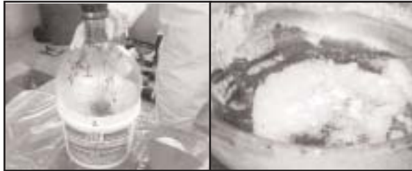
A variety of chemicals such as red phosphorous, seen here on the left, can be used to produce the methamphetamine, seen here on the right.

The essential and precursor chemicals can be diverted into the illicit drug market in various ways, among which are the following: