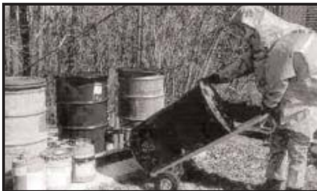
Disposing of chemicals at clandestine drug labs requires special training and equipment.

† In the United States, the Occupational Safety and Health Administration has established guidelines and requirements that govern exposure to clandestine drug labs (see the Code of Federal Regulations at 29 C.F.R. 1910.120). The Drug Enforcement Administration, Environmental Protection Agency and Coast Guard have jointly published a document titled Guidelines for the Cleanup of Clandestine Drug Laboratories , available to police agencies.